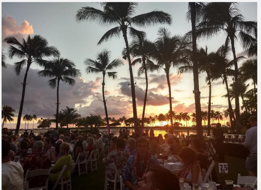
Sunset October 19 at the ICD-USA lū'au Hilton Hawaiian Village, Honolulu