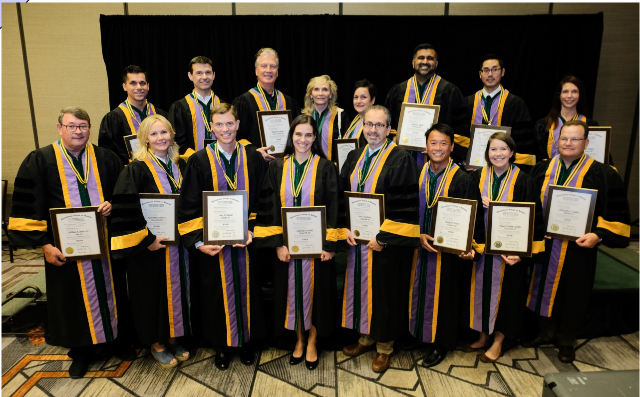
Fifteen new ICD Fellows from North Carolina, South Carolina, and Virginia were inducted October 19, 2018 in Honolulu, at the ICD Annual Meeting and Convocation.